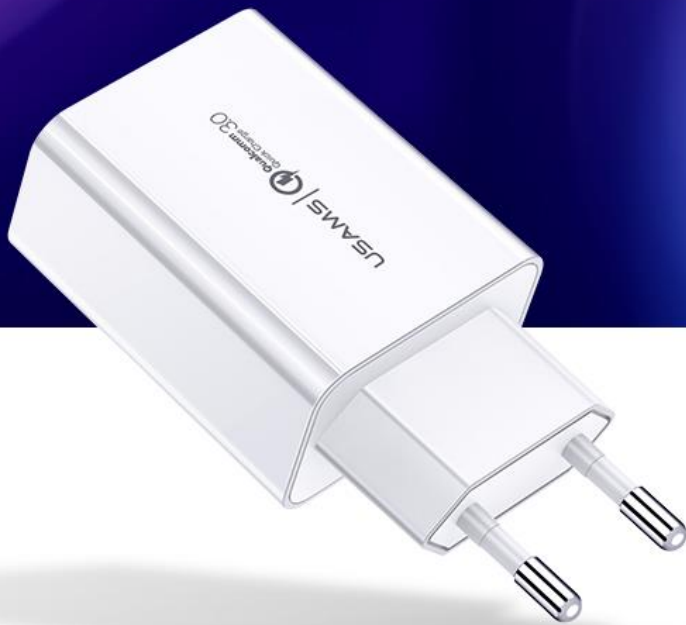
QC3.0 Travel Charger