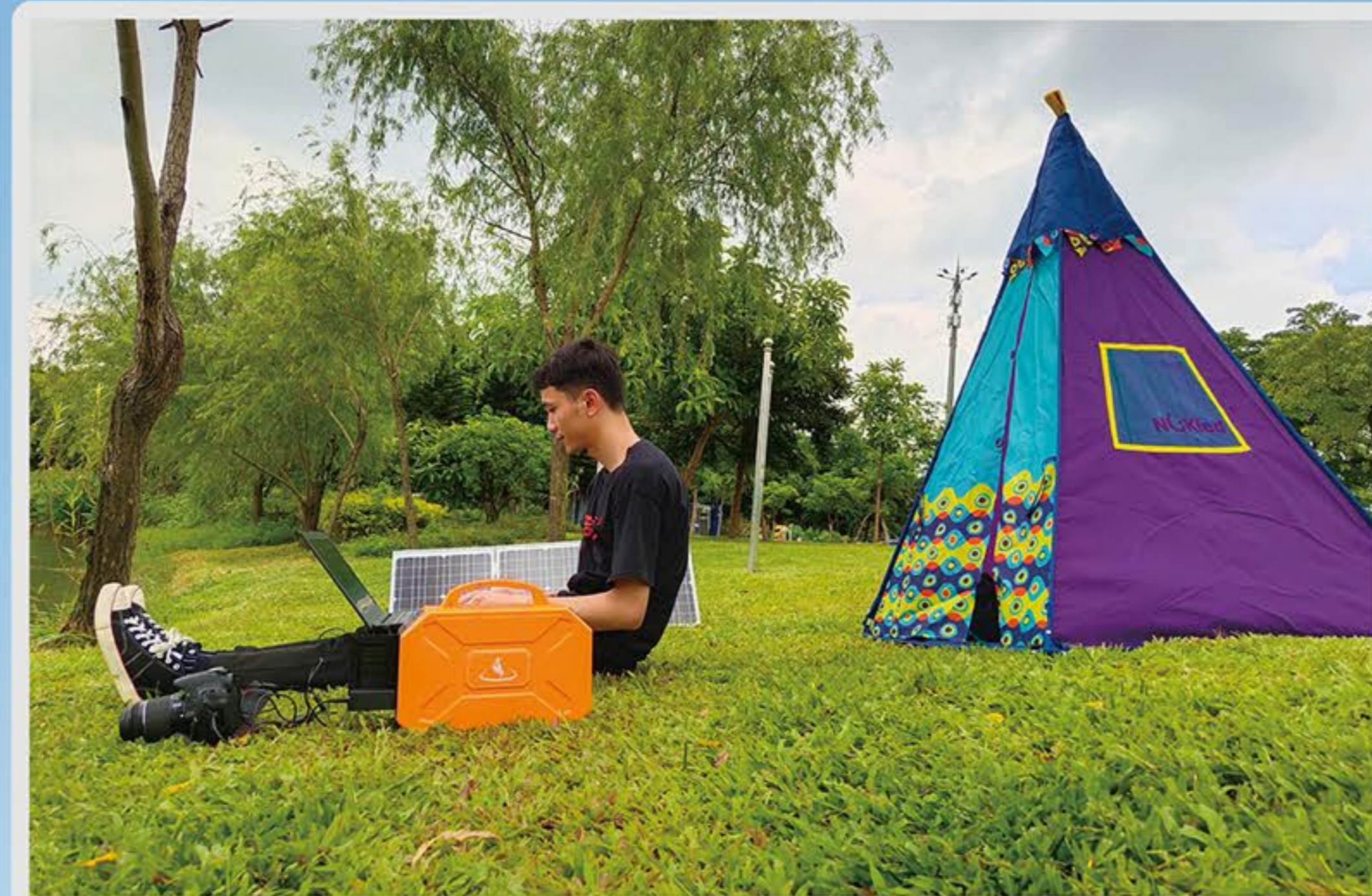
Outdoor Camping Power Supply