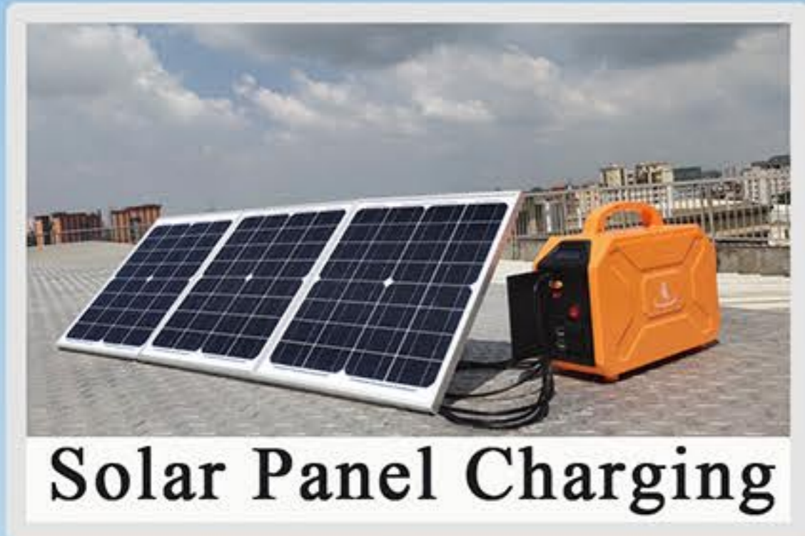
Solar Panel Charging