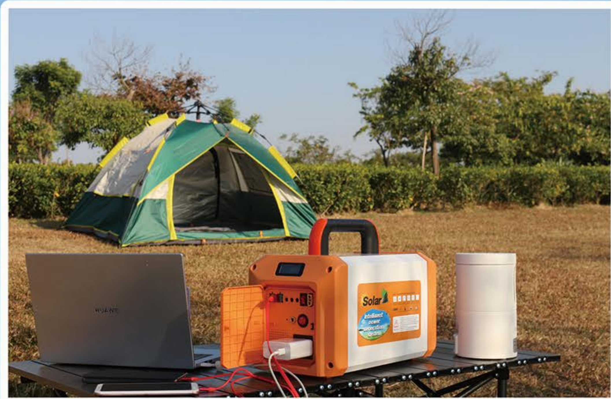
Outdoor Camping Power Supply