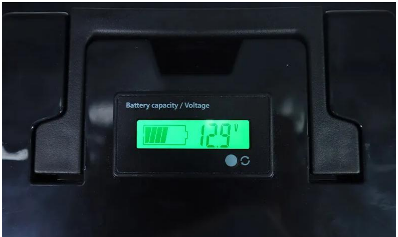
LCD display reference image