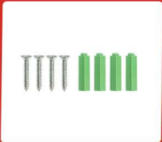
Mounting Screws Bag