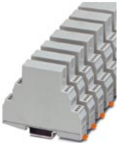
Electronic housing for installation distributors, double-level, for insertion of a p.c.b.

Please be informed that the data shown in this PDF Document is generated from our Online Catalog. Please find the complete data in the user's documentation. Our General Terms of Use for Downloads are valid ( http://download.phoenixcontact.com )