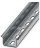
DIN rail, material: Galvanized, perforated, height 15 mm, width 35 mm, length: 2 m

DIN rail - NS 35/15 ZN PERF 2000MM - 1206599