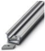
DIN rail, deep drawn, high profile, unperforated, 1.5 mm thick, material: aluminum, height 15 mm, width 35 mm, length 2000 mm

DIN rail, unperforated - NS 35/15 AL UNPERF 2000MM - 1201756