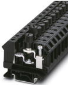
Fuse terminal block for cartridge fuse insert, cross section: 0.5 - 16 mm 2 , AWG: 24 - 6, width: 12 mm, color: black

Please be informed that the data shown in this PDF Document is generated from our Online Catalog. Please find the complete data in the user's documentation. Our General Terms of Use for Downloads are valid ( http://download.phoenixcontact.com )