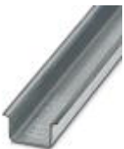
DIN rail, material: Galvanized, unperforated, height 15 mm, width 35 mm, length: 2 m

DIN rail - NS 35/15 ZN UNPERF 2000MM - 1206586