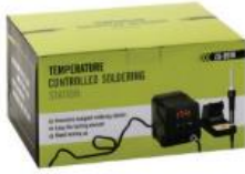
color box package